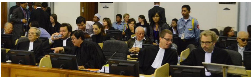
The Defence bench prior to the start of a hearing in Case 002.