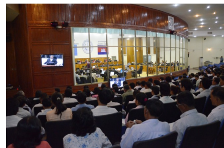
Villagers from Kampong Cham attend the trial hearing.