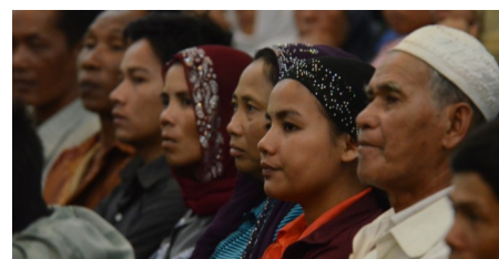
Villagers from Kampong Cham attend the court hearings on 21 and 26 June 2012. On 21 June, 570 villagers from 17 different districts visited the ECCC.