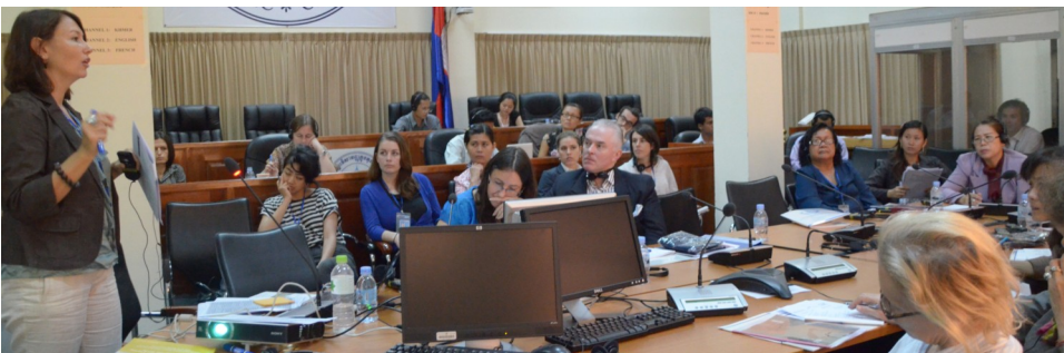
ECCC officials and staff attend the workshop.

More than 40 professionals from the Khmer Rouge tribunal spent a whole day discussing sexual violence in transitional justice, participating in a training workshop on “Gender Sensitivity and Transitional Justice” held on Friday 22 June.