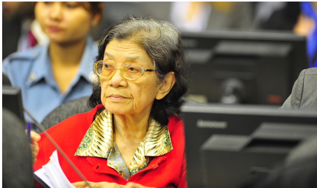
Accused Ieng Thirith, former Khmer Rouge Minister for Social Affairs, attends the trial proceedings in the courtroom.