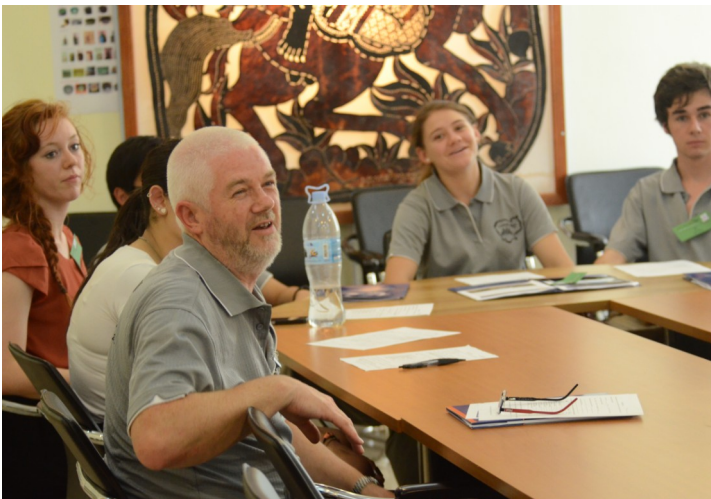
Australian students and professor from Ivanhoe Grammar school listen to a briefing by Public Affairs.