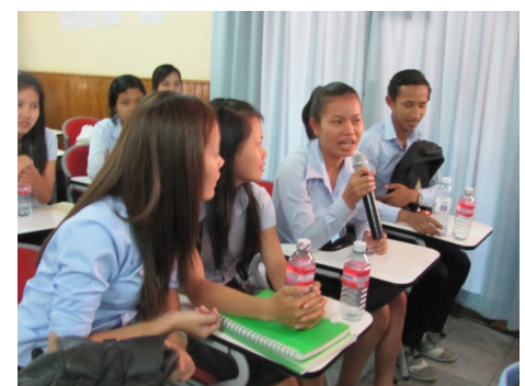
Students participate in discussion after viewing the film.