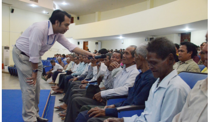
Villagers from Siem Reap visit the court and attend a study tour.

24-25 July: TPO and CDP will host a forum theater play in Kampong Thom on the topic of gender based violence under the Khmer Rouge regime. More than 40 villagers are expected to participated.