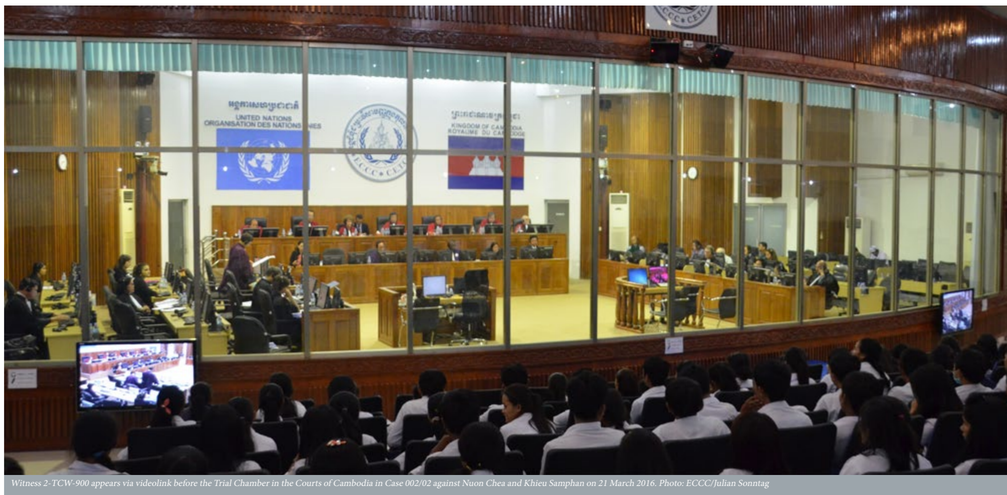
Witness 2-TCW-900 appears via videolink before the Trial Chamber in the Courts of Cambodia in Case 002/02 against Nuon Chea and Khieu Samphan on 21 March 2016.