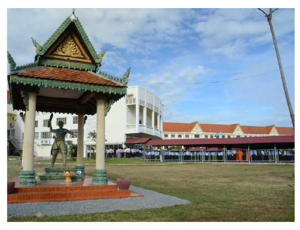
Visitors line up outside the court.