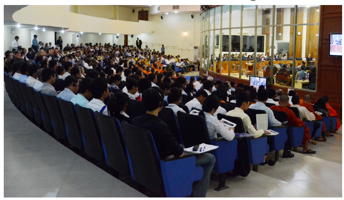
Monks and members of the public watch the responses on 23 November.