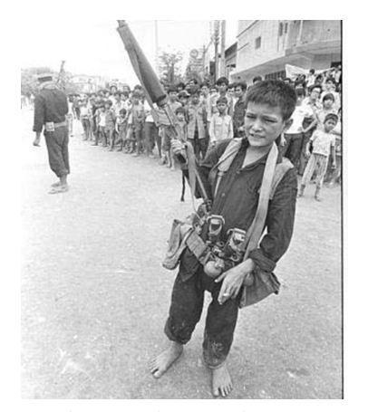
Phnom Penh, 17 April 1975

latter half of the Democratic Kampuchea regime, a massive purge took place in the East Zone, resulting in to 250,000 deaths and forced transfer of nearly its entire population to other parts of the coun-