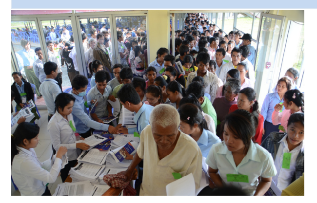
Visitors enter the court.

It is like a tree, it starts from the trunk then the branches will be what the trunk provides. [The Accused] were the trunk, so they designed the branches. They cannot blame the branches. The trunk comes first, then the branches come later. They cannot blame the lower ranking ones.