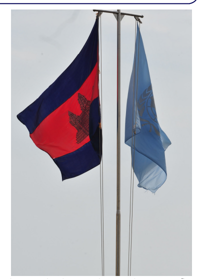
The Cambodian and United Nations flags.

On 14 November, the leng Thirith Defence Team filed its Objections to the Co-