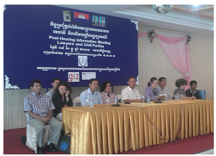
Presenters at post-hearing information session.

On 4 November, the National Lead Co-Lawyers participated in a radio talk show on FM 102 about the substantive hearings.