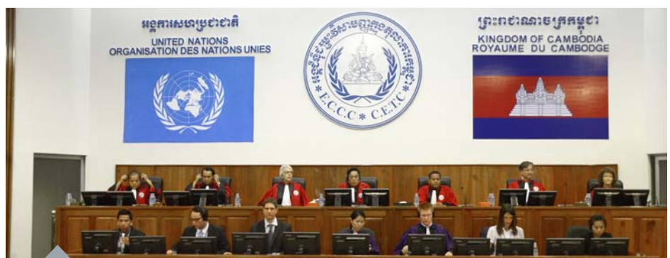
Judges of the Trial Chamber during the Closing Statement on 31 October 2013.

The hearing will be open to the public and the media. If discussion on potential witnesses, civil parties and experts warrants the holding of some portions of the hearing in closed session, such closed sessions will be held at the end of the hearing.