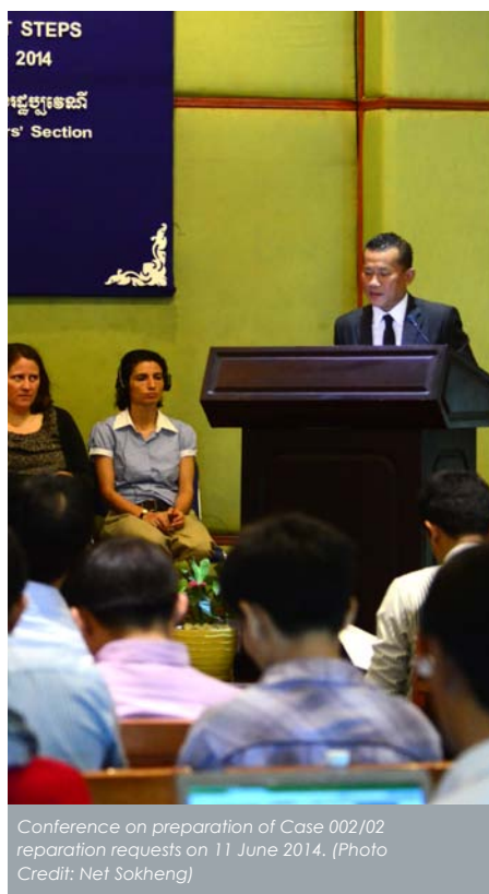
Conference on preparation of Case 002/02 reparation requests on 11 June 2014.

These bodies will work in partnership to provide financial, political and technical support for project development and implementation, in the interest of bringing redress to victims of the Khmer Rouge regime. Such projects seek to uphold the dignity of victims, retain collective memory and mitigate the harms experienced. The realization of any reparation claim of the civil parties is dependent on the conviction of the Accused.