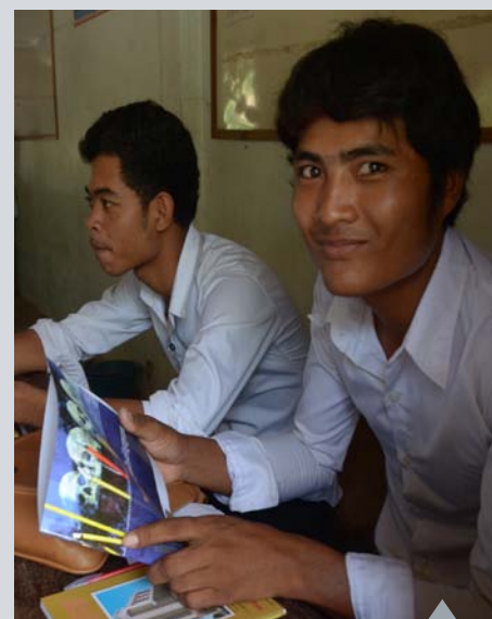
High school students listen to a presentation during an ECCC outreach activity in their school in Kampeung Speu Province.

June: (KRT Watch Program) CHRAC will hold a half-day legacy workshop with university students. The theme of the event is “Annotated Cambodia Code of Criminal Procedure and Important Strategies for the Implementation of ECCC’s Best Practice and International Fair Trial Standards”.