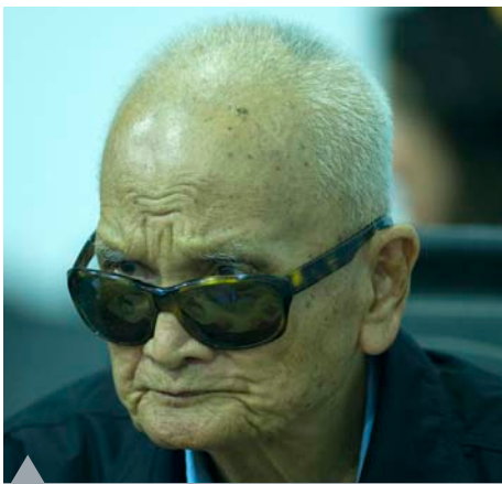
Nuon Chea, former Deputy Secretary General of CKP.