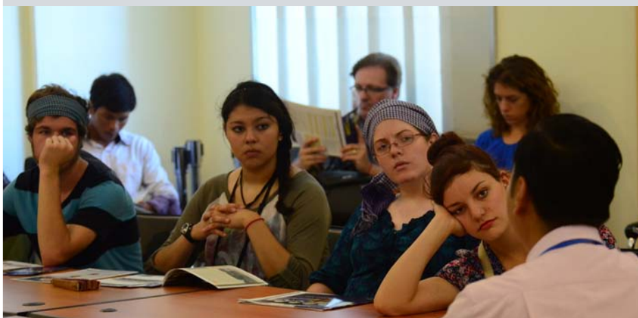
Students from the United States appreciated having the opportunity to learn about the work of the ECCC.

There was a broad consensus that justice should not only be served through trial judgements, but through community activities that foster an understanding of the trial process and its outcomes.