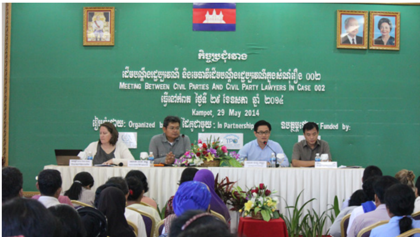
The Victims Support Section convenes a coordination meeting with its partners to discuss the implementation of reparation projects.

ceased. The objections concerned, first, the statute of limitations for grave breaches of the Geneva Conventions, and, second, jurisdiction over the crime against humanity of deportation in respect of determined crime sites.