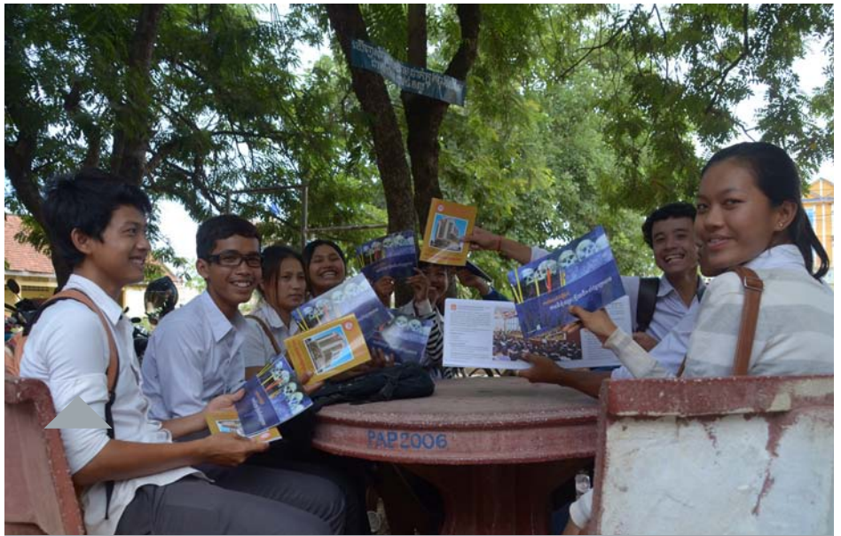
The ECCC outreach team visited local communities and four high schools in Kampong Speu Province.

The students were very curious to learn more about the ECCC outreach programme and they were keen to discuss what they knew and had learned about the Khmer Rouge and the trials. They even shared personal stories about their families during the regime and their hopes for the future.