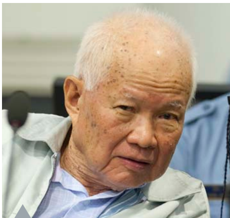
Khieu Samphan, former Head of State of Democratic Kampuchea.