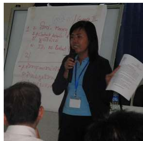
Leading one of the group discussions.