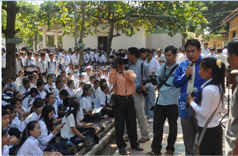
Head of Public Affairs give students a quiz on the Khmer Rouge trials at Takhmao high School in Kandal

The briefings at school are the court's latest effort to help educate young people on the Khmer Rouge tribunal, which unearths a dark chapter of Cambodia's history. Now that the majority of Cambodia's population was born after the Khmer Rouge regime collapsed in early 1979, the trial at the ECCC presents a unique opportunity for the young generations to understand what happened to their parents' and grandparents' generations and the country that has enjoyed relative peace for more than a decade.