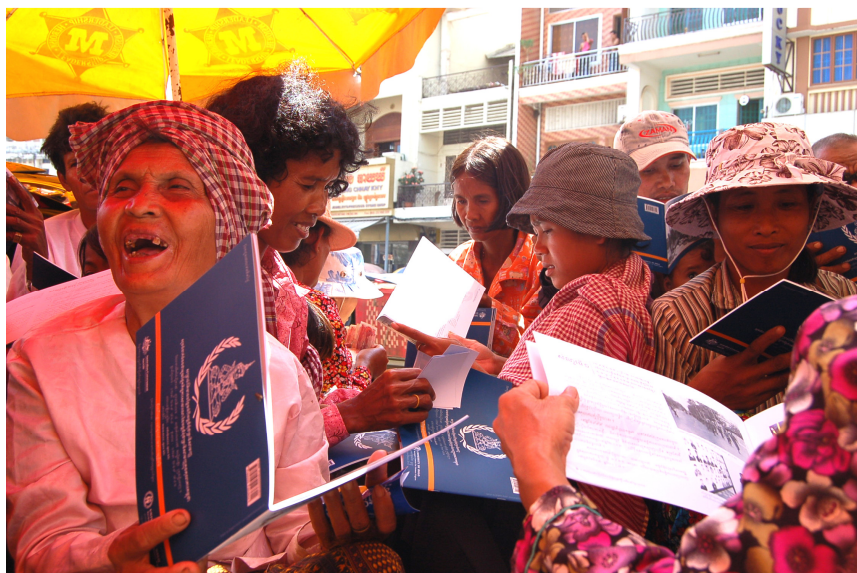
Cambodians riding on a pickup truck at a bus station in Phnom Penh near Phsar Thmei look at the ECCC booklets

Making the court more visible to ordinary people in the urban Cambodia and reaching out to potential Complainants and Civil Party applicants before the deadline for application for Case 002 later this year, the Public Affairs Section kicked off on 27 October a sensitization campaign to go around downtown Phnom Penh to distribute its information materials.