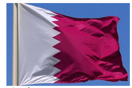
Flag of Qatar

donors in our pursuit of legal accountability for the crimes committed during the period of Democratic Kampuchea."