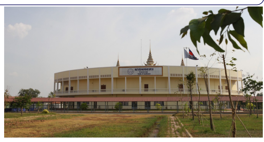
The ECCC court building (File Photo)

On 21 March, the Trial Chamber denied the request of the Khieu Samphan defence to delay the commence-