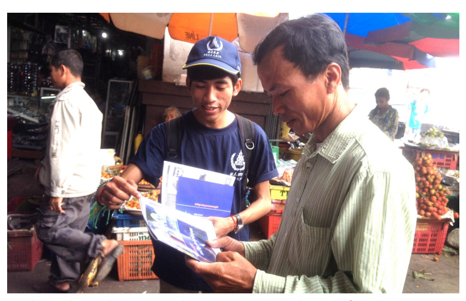
A volunteer law student gives out documents introducing the work of the Khmer Rouge tribunal in a market in Sihanoukville.

The ECCC has been conducting study tours for villagers and students from across Cambodia since 2009. More than 200,000 people have benefitted from the study tours so far and visited the court as well as the S-21 Tuol Sleng Museum and Choeung Ek killing fields for guided tours. RULE's volunteer group was one such study group. It is the first time that study tour participants have conducted outreach activities on behalf of the