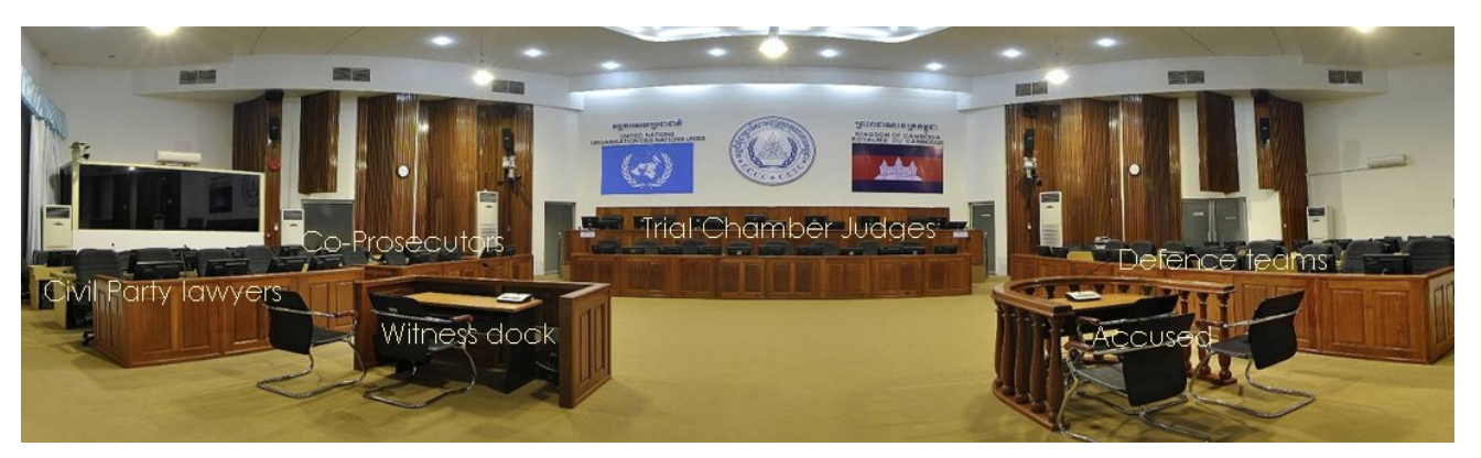
A panoramic view of the main courtroom in the Extraordinary Chambers in the Courts of Cambodia

21 March 2014: Decision on Khieu Samphan Request to Postpone Commencement of Case 002/02 Until a Final Judgement is Handed Down in Case 002/01 <E301/5/5/1>