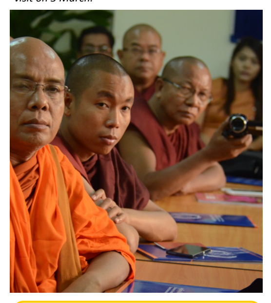
A group of monks, nuns and laymen coming from Myanmar receives a presentation on 21 March.