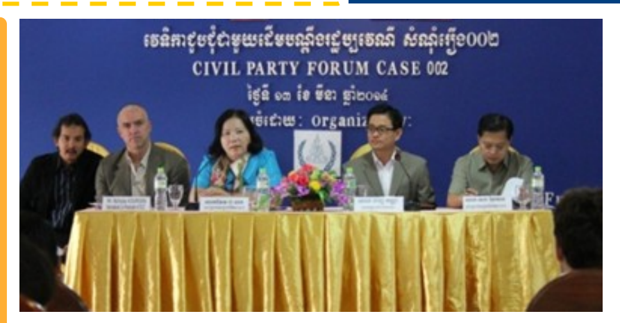
The Victim Support Section organises a Civil Party Regional Forum in Kampong Cham On 13 March.

viewed their client's medical report resulting from that medical examination and declined to request a hearing to question the experts on this report. The team has otherwise been fully focused on preparing for the Case 002/02 trial.