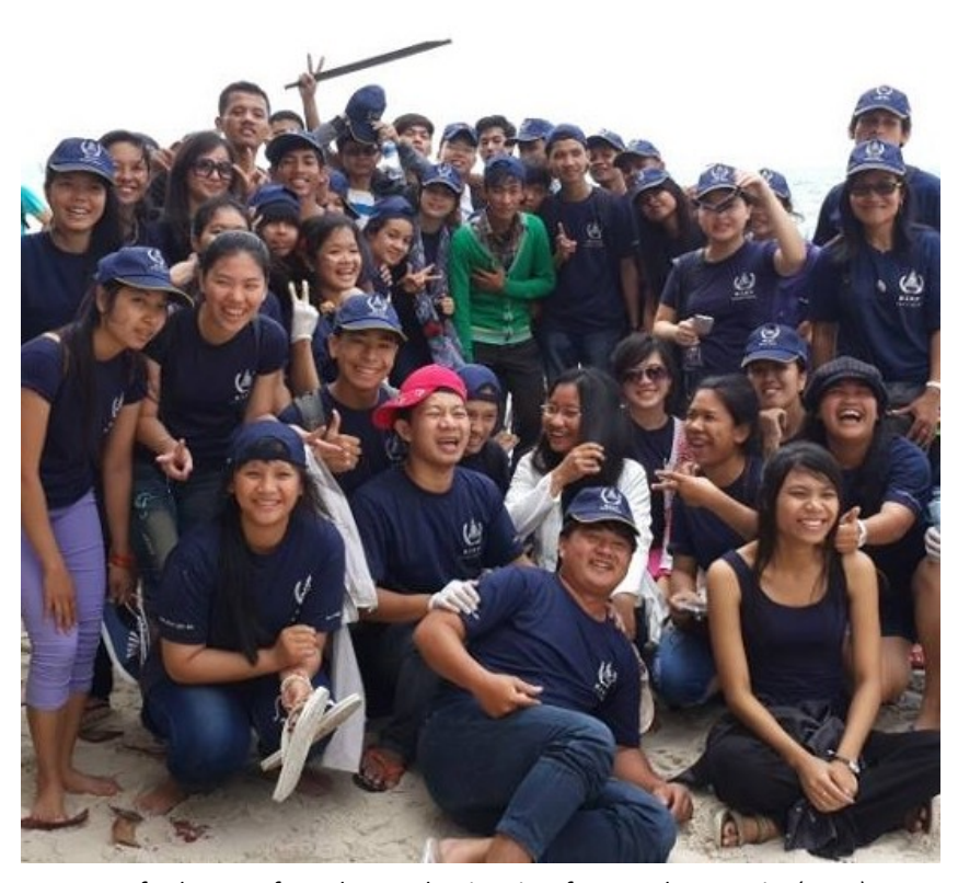
A group of volunteers from the Royal University of Law and Economics (RULE) poses after they distributed outreach material about the Khmer Rouge tribunal to villagers in Preah Sihanouk province on 14 March.