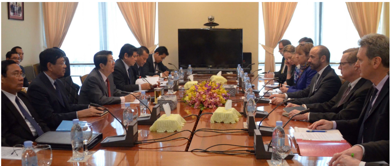
Deputy Prime Minister Sok An (third from the left) discusses funding issues of the Extraordinary Chambers in the Courts of Cambodia with a high-level UN delegation during a meeting held on 27 January in Phnom Penh.

The UK government has been a staunch supporter of the ECCC and has contributed more than £6 million to date.