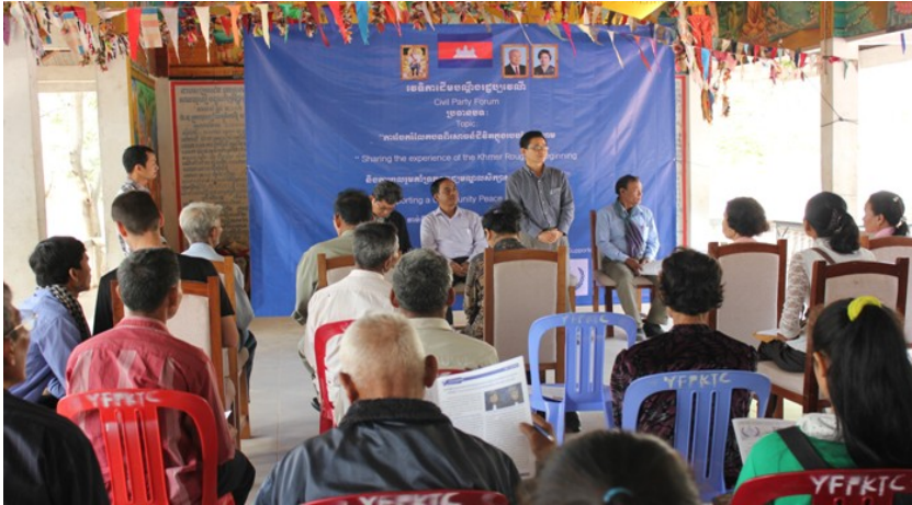
VSS participates in a civil party forum at Kraing Tachan, a community peace learning center in Takeo, to update civil parties on the judicial proceedings and reparation issues.

cific crime sites. Additionally, civil parties seek the inclusion of three sites and one additional charge in the scope of Case 002/02: Trapeang Thma Dam worksite, North Zone Security Centre, Koh Kyang Security Centre and forced transfer phase three, including the related purges of the East Zone.