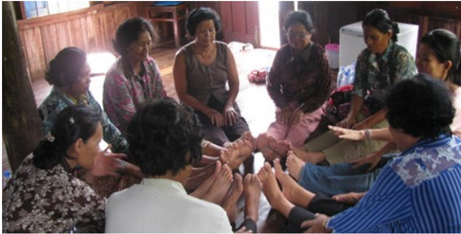
VSS, TPO and CDP organize jointly community-based activities with survivors of gender based violence under the Khmer Rouge regime.

The first non-judicial project of the Extraordinary Chambers in the Court of Cambodia to address needs of Khmer Rouge victims was showcased in two documentaries on 29 January in Phnom Penh.