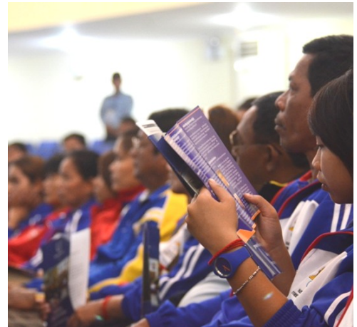
Members of the delegation from the Cambodian Olympic Committee receive a presentation in the public gallery.

The school's director added that the Grade 12 students, who will soon take the baccalaureate exam, can use the booklet as a study aid and to reinforce their knowledge of Cambodia's contemporary history.