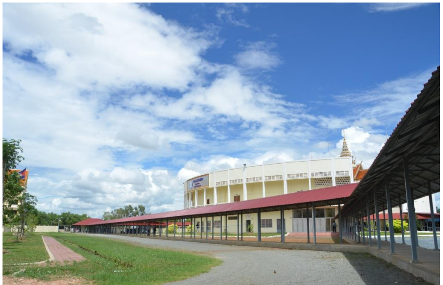
The ECCC court building (file photo)

The Investigation Unit has conducted one field mission for Case 003 and one for Case 004 (six witness interviews and three investigative action reports were drafted). In addition, five witnesses were interviewed on the premises of the ECCC (one for Case 003 and four for Case 004) and one forwarding order was sent to the Office of the Co-Prosecutors in Case 004.