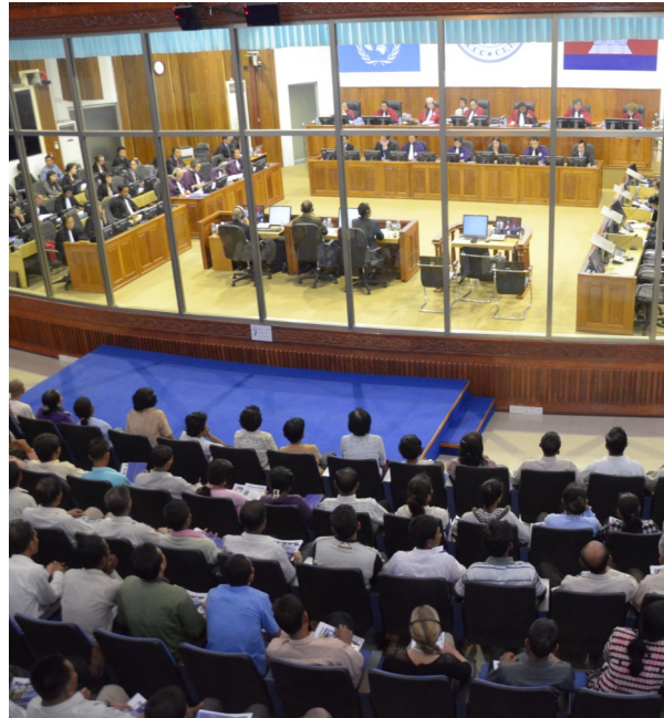
Public attends a hearing at the ECCC [File photo]

Hearing to address the scope of Case 002/02 and other necessary issues before the commencement of the substantive hearing in Case 002/02.