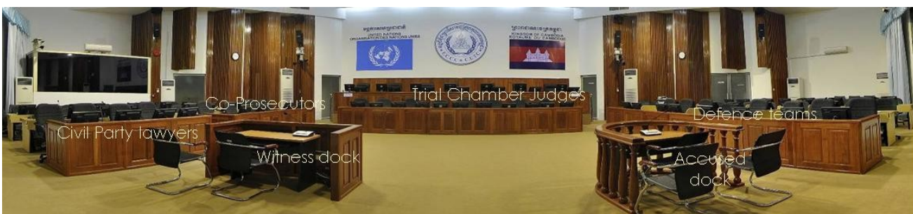
A panoramic view of the main courtroom in the Extraordinary Chambers in the Courts of Cambodia

The court provides simultaneous interpretation of its proceedings in Khmer, English and French. The speakers in the main courtroom project the proceedings in Khmer, but English and French translation is also available through the headsets on either side of the main courtroom. English is on channel 2 and French is on channel 3.