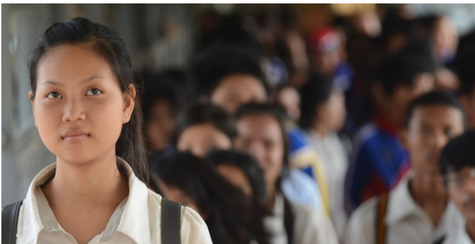
Students and athletes from the Cambodian Olympic Committee line up at the entrance of the court building.

24 February: A 23-member delegation from the American Bar Association visits the ECCC and meets with judicial officials.