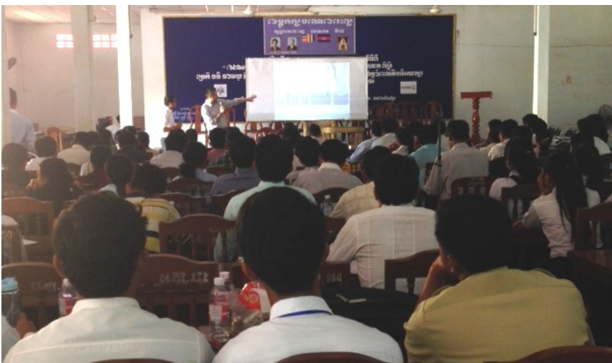
A senior assistant prosecutor gives a presentation to teachers in Battambang at an outreach event organized by the Documentation Center of Cambodia.

Lawyers for civil parties made two important filings in the month of January. The first sought to protect the confidentiality of civil party applications and related documents in Case 002. The second was on the scope of the next trial, Case 002/02, in which the Civil Parties supported the scope proposed by the Prosecution, but also asked the Trial Chamber to expand the treatment of the crimes related to forced marriage and the Buddhists to a nationwide scope, not limited to spe-