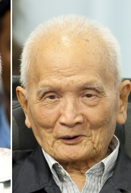
News and notes