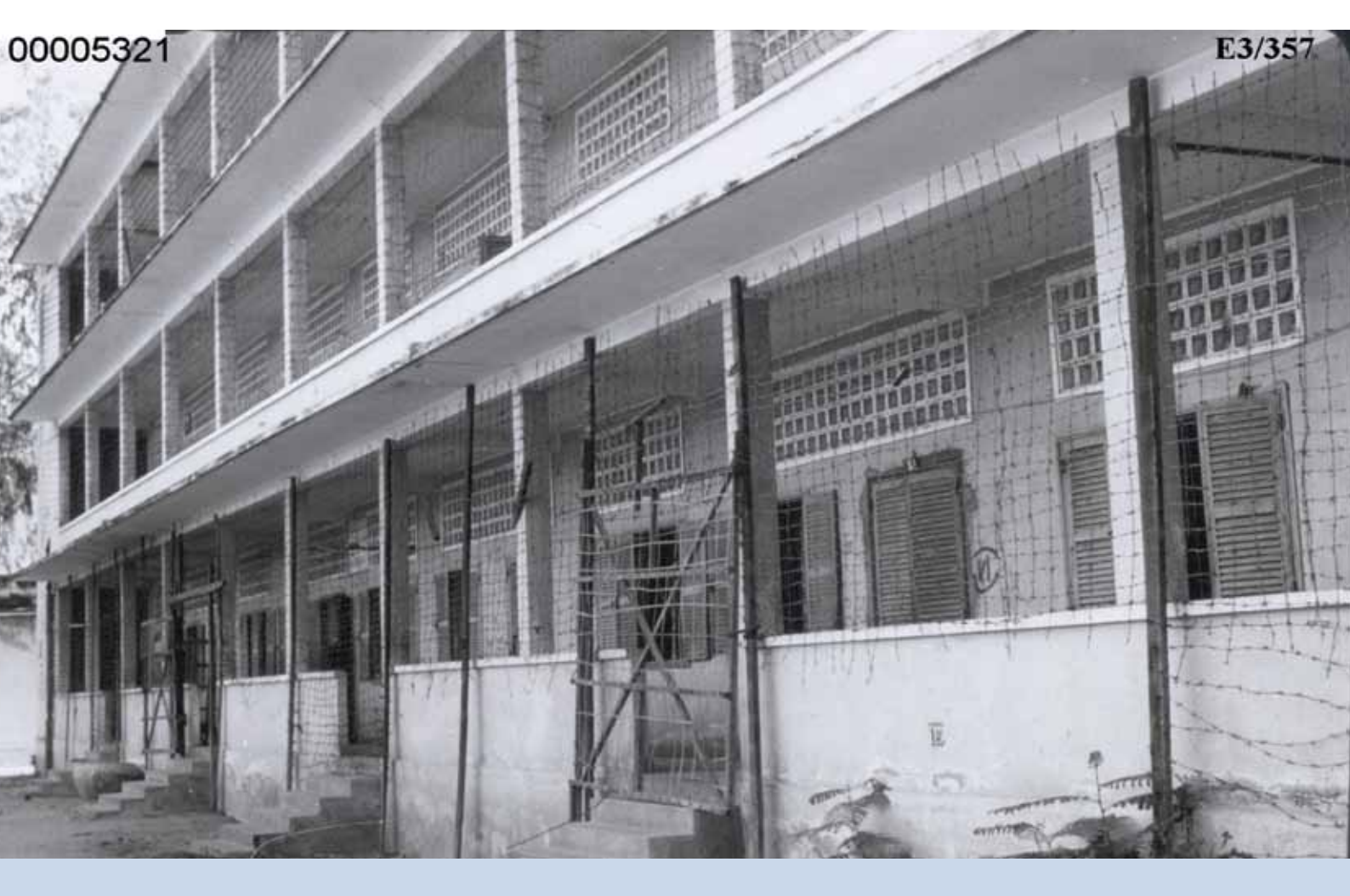
Photo of the front of building "C" at S-21 in 1979. This photo is taken from the Case File in Case 001 and was introduced as evidence during the trial.